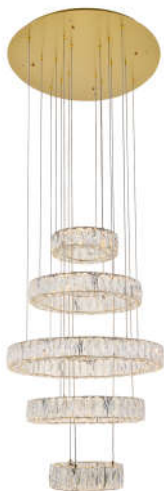
Gold Item No:3503G3LG