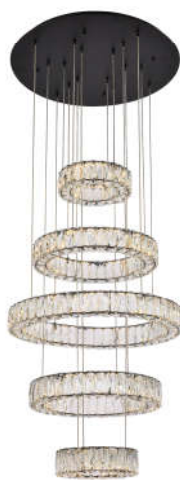
Black Item No:3503G3LBK